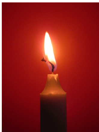
Figure 3.6.2: Burning of wax to generate water and carbon dioxide is a chemical reaction.

One good example of a chemical change is burning a candle. The act of burning paper actually results in the formation of new chemicals (carbon dioxide and water) from the burning of the wax. Another example of a chemical change is what occurs when natural gas is burned in your furnace. This time, on the left there is a molecule of methane, \text{CH}_4 , and two molecules of oxygen, \text{O}_2 ; on the right are two molecules of water, \text{H}_2\text{O} , and one molecule of carbon dioxide, \text{CO}_2 . In this case, not only has the appearance changed, but the structure of the molecules has also changed. The new substances do not have the same chemical properties as the original ones. Therefore, this is a chemical change.