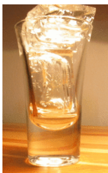
Figure 3.6.1: Ice melting is a physical change. When liquid water ( H_2O ) freezes into a solid state (ice), it appears changed; however, this change is only physical, as the composition of the constituent molecules is the same: 11.19% hydrogen and 88.81% oxygen by mass. (Public Domain; Moussa).

As an ice cube melts, its shape changes as it acquires the ability to flow. However, its composition does not change. Melting is an example of a physical change. A physical change is a change to a sample of matter in which some properties of the material change, but the identity of the matter does not. When liquid water is heated, it changes to water vapor. However, even though the physical properties have changed, the molecules are exactly the same as before. We still have each water molecule containing two hydrogen atoms and one oxygen atom covalently bonded. When you have a jar containing a mixture of pennies and nickels and you sort the mixture so that you have one pile of pennies and another pile of nickels, you have not altered the identity of the pennies or the nickels—you've merely separated them into two groups. This would be an example of a physical change. Similarly, if you have a piece of paper, you don't change it into something other than a piece of paper by ripping it up. What was paper before you started tearing is still paper when you are done. Again, this is an example of a physical change.