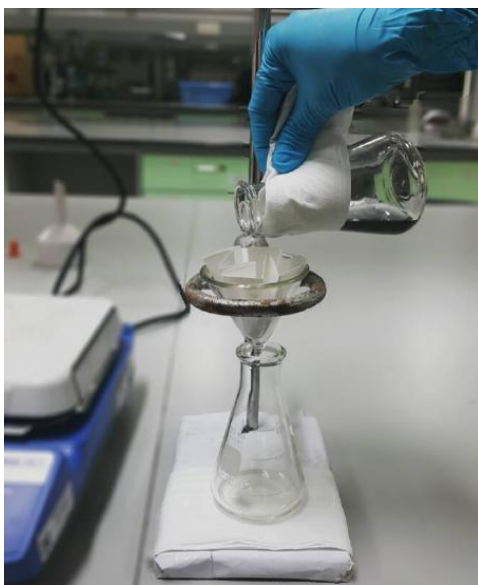
Figure 3.6.4: Filtration for the separation of solids from a hot solution. (CC BY-SA 4.0; Suman6395).